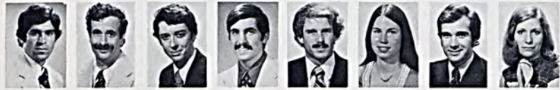
MAYO McALLISTER McDANIEL McDERMOTT McDOUGAL McGRADY MEYERS MILLER