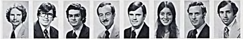
HEBELER HICKS HIGHTOWER HILL HOUK HUBER HUTCHSON HYSLOP