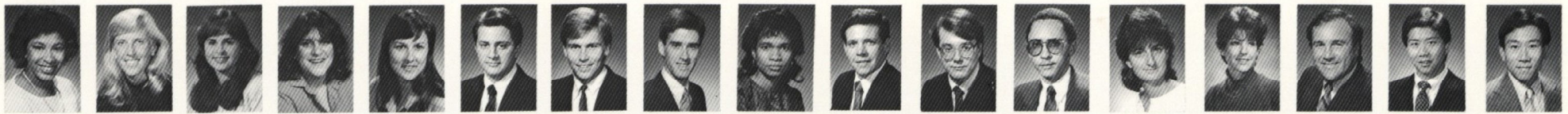
ABNEY ALLEN ALLINE ALMOJAN ARMSTRONG AZAR BARRON BARTHOLOMEW BASTIAN BEATSE BLAYDON BOUCREE BRINKLEY BROFFMAN CAREY CHEN CHIA