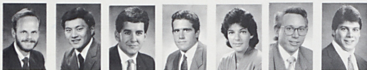
FULFORD FUNG GALINDEZ GARCIA GARDNER GARGES GEORGE