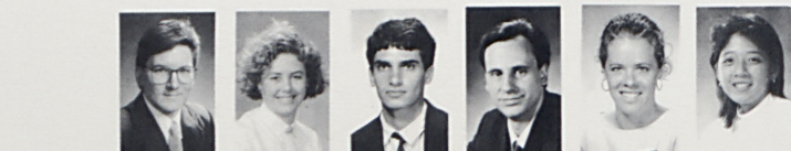
SITZMAN SNIDER SPARKS STOKMANIS SWARZTRAUBER TAN TATHAM TEPPER TSUI VOLKMAN