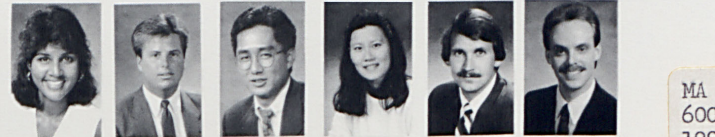
VYAS WILES WON WONG WOOLVERTON WREN