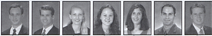
Dugai Einch Essie Engel Faggen Fagley Fee