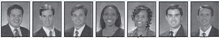
Gaffud Galindo Gaon Glass Gooden Hall Haligan